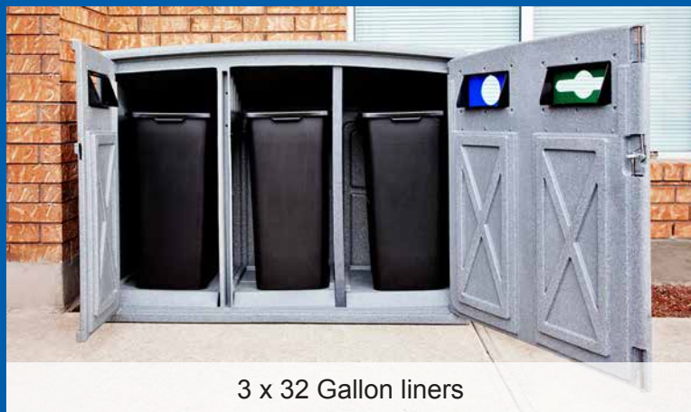
3 x 32 Gallon liners