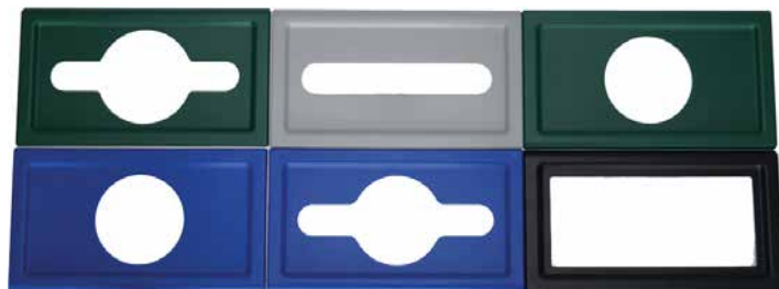
Variety of lid openings & stamping options